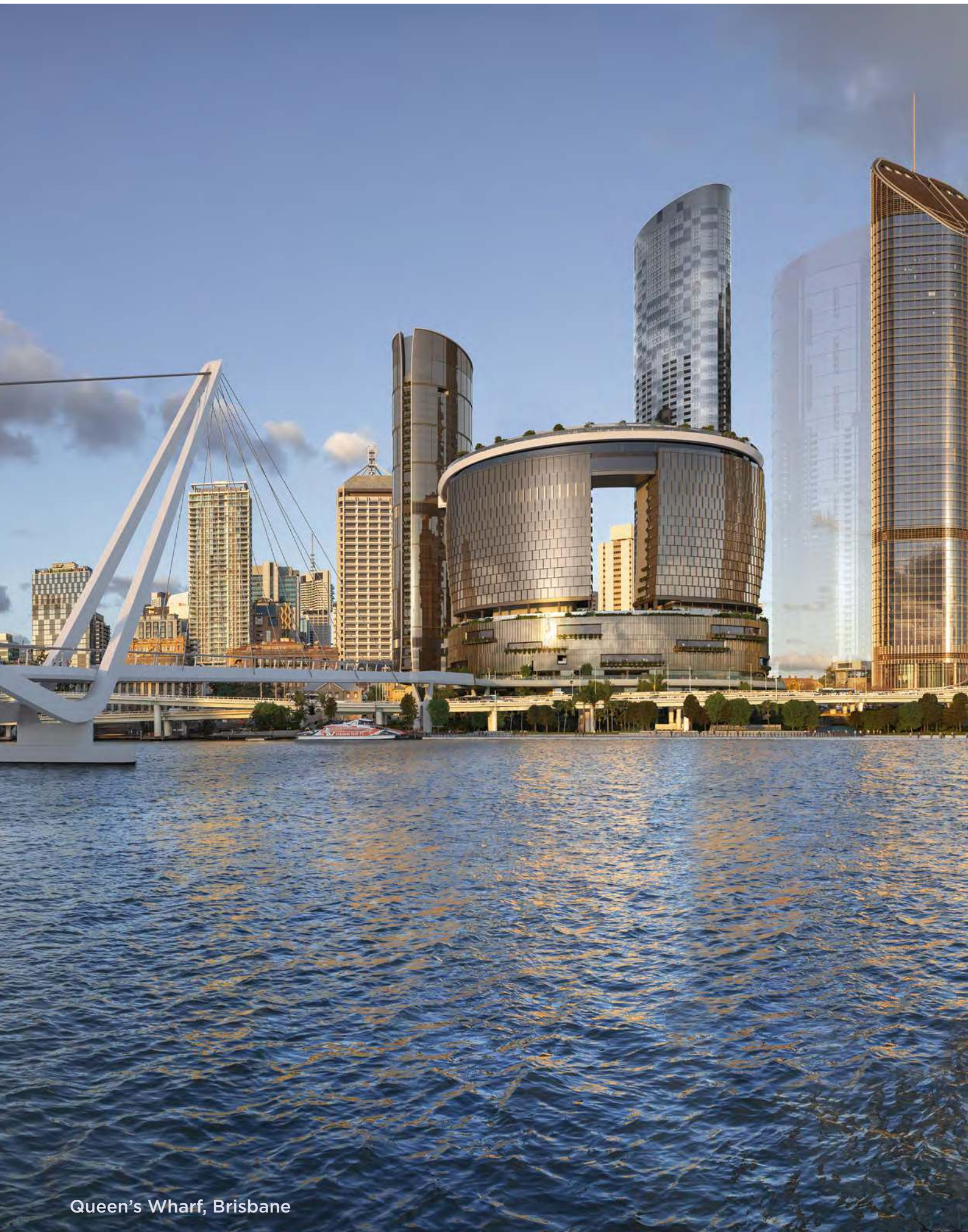
Queen's Wharf, Brisbane